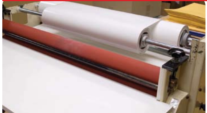
Easy application by machine lamination.

Let us show you the advantages of FluoroGrip® Film for graffiti protection. Contact Integument Technologies for the name of the representative nearest you to arrange a demonstration.