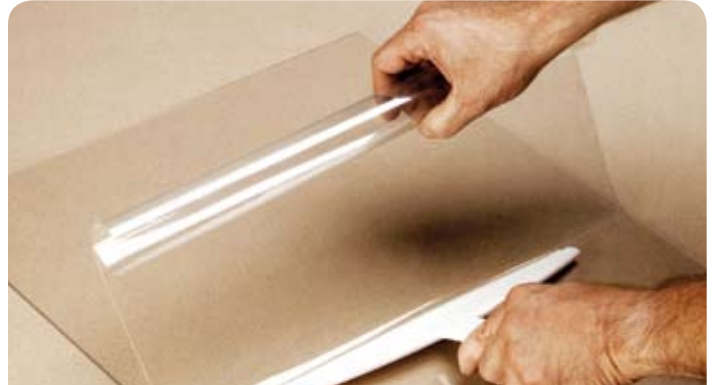
Easy application by hand lamination.