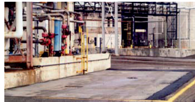
Secondary containment — Truck unloading pad with 3/8" non-skid topping

Request specific fluoropolymer film technical data sheets for further information