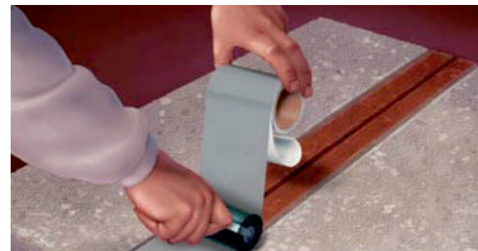
Teflon® expansion joint — Crack tapes

Contact your Integument representative for a recommendation on the best products for your specific application.